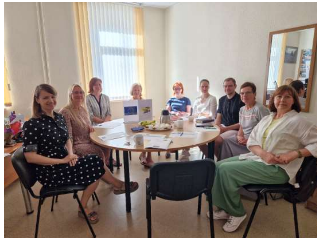
2x Stakeholder meetings organized in Daugavpils (12.08.; 21.09.)